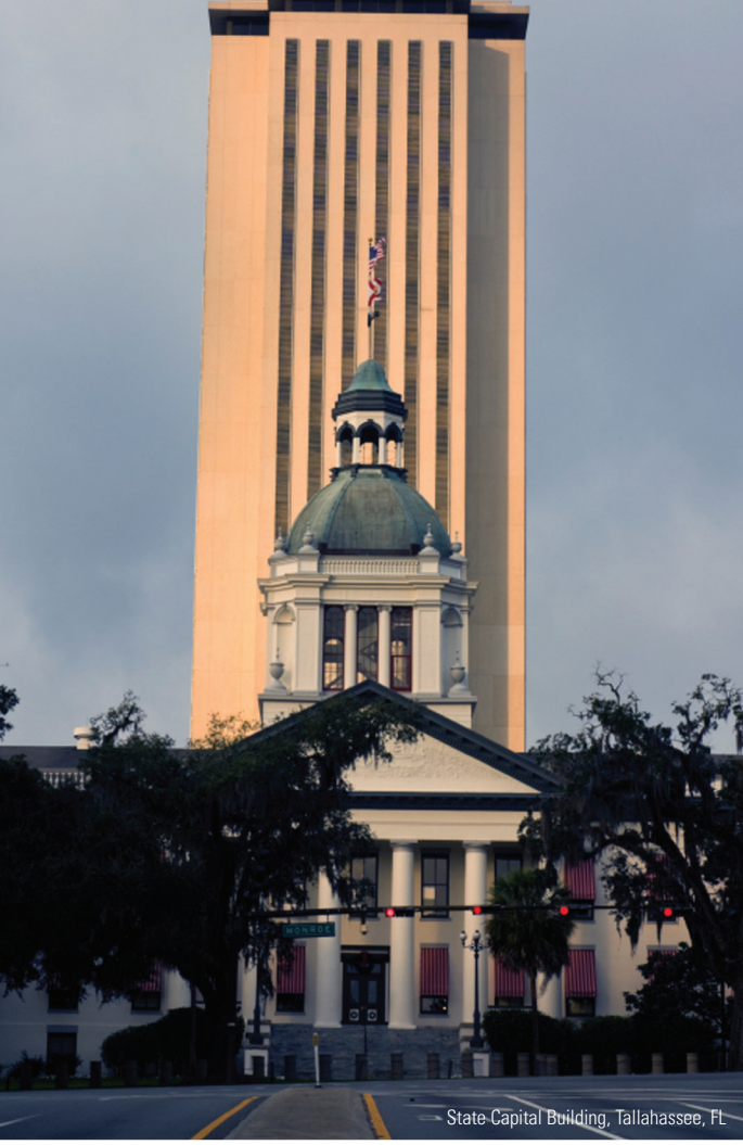
State Capital Building, Tallahassee, FL

Membership, American Planning Association PO Box 4291 Carol Stream, IL 60197-4291